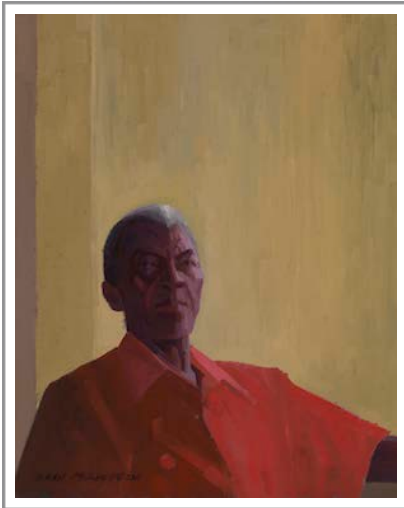
Dean Mitchell, 2011, Southern Pride (Joseph Northern) , oil, 11 x 14 inches